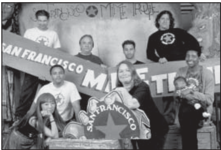
The San Francisco Mime Troupe will be performing October 10 and 11.