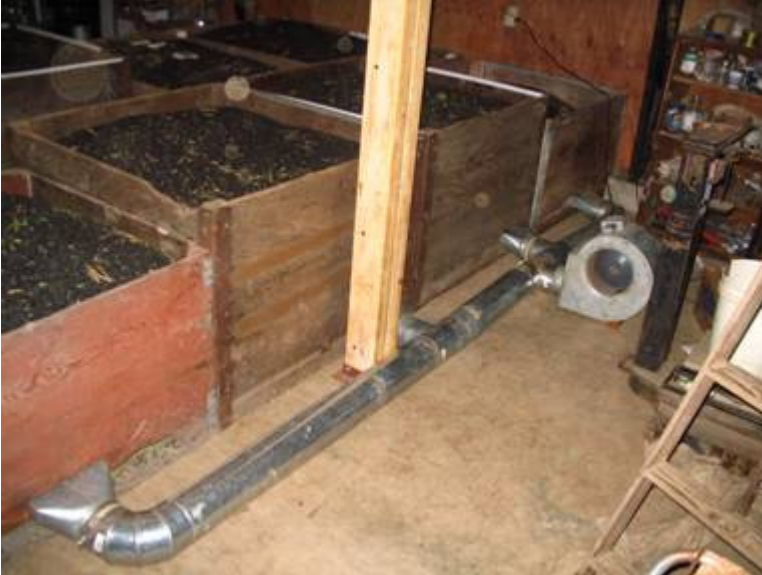
Figure 6. Grain drying bins, made from 4ft x 4 ft totes, connected to a blower.